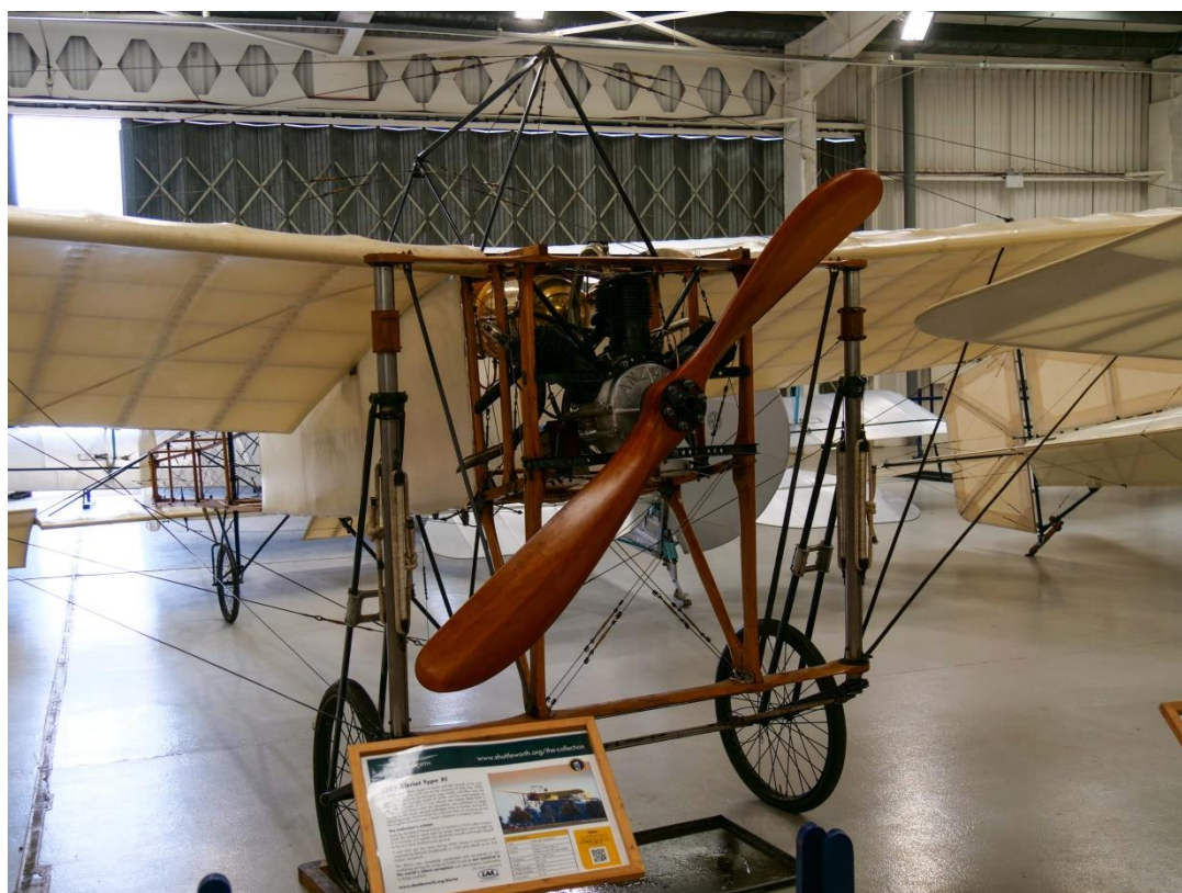
The 1909 Bleriot

The flying display was planned to feature around 30 aircraft, a mixture of Shuttleworth exhibits and visiting aircraft from the Fighter Collection, Navy Wings, Kennet Aviation and Historic Helicopters.