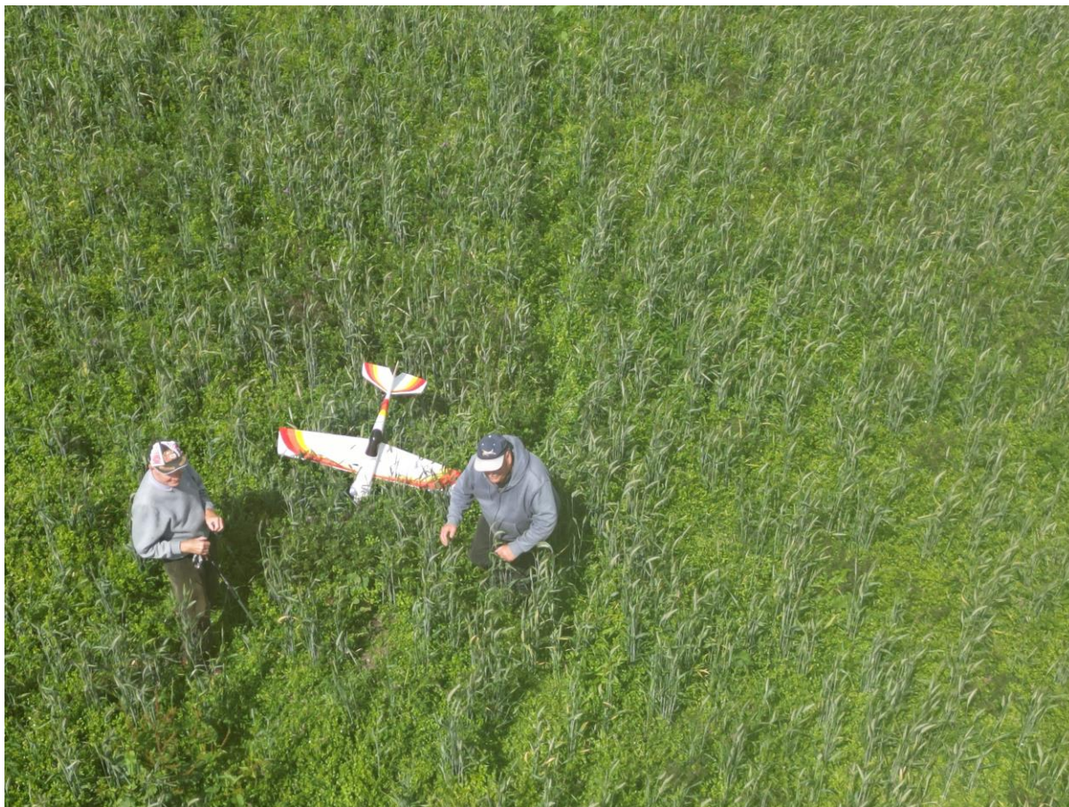
The Acrowot located!