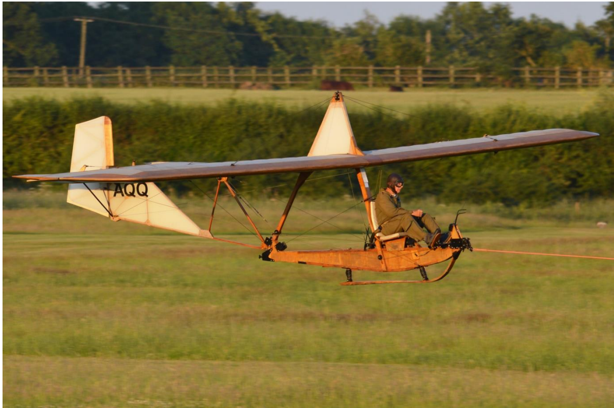
The Eon Primary SG.38 Glider