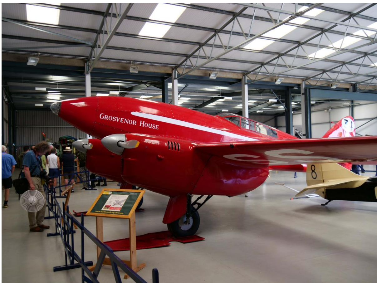
The DE Havilland DH88

The weather was beautiful, blue sky and fluffy white clouds. We started our day with a tour of the aircraft hangers, some really interesting aircraft; they even had the local model aircraft club displaying a few models. Most of the aircraft had oil in their drip trays and there was a faint smell of oil in the air, testament that all of the aircraft are flown regularly. The last hanger contains some beautiful racing aircraft from the 1930s, including the famous DE Havilland DH88 comet - Grosvenor House.