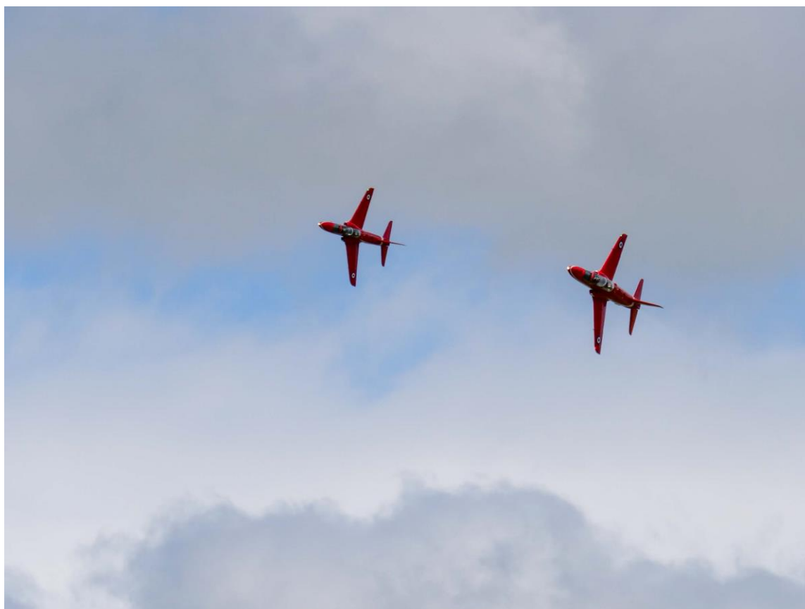
The Reds Duo