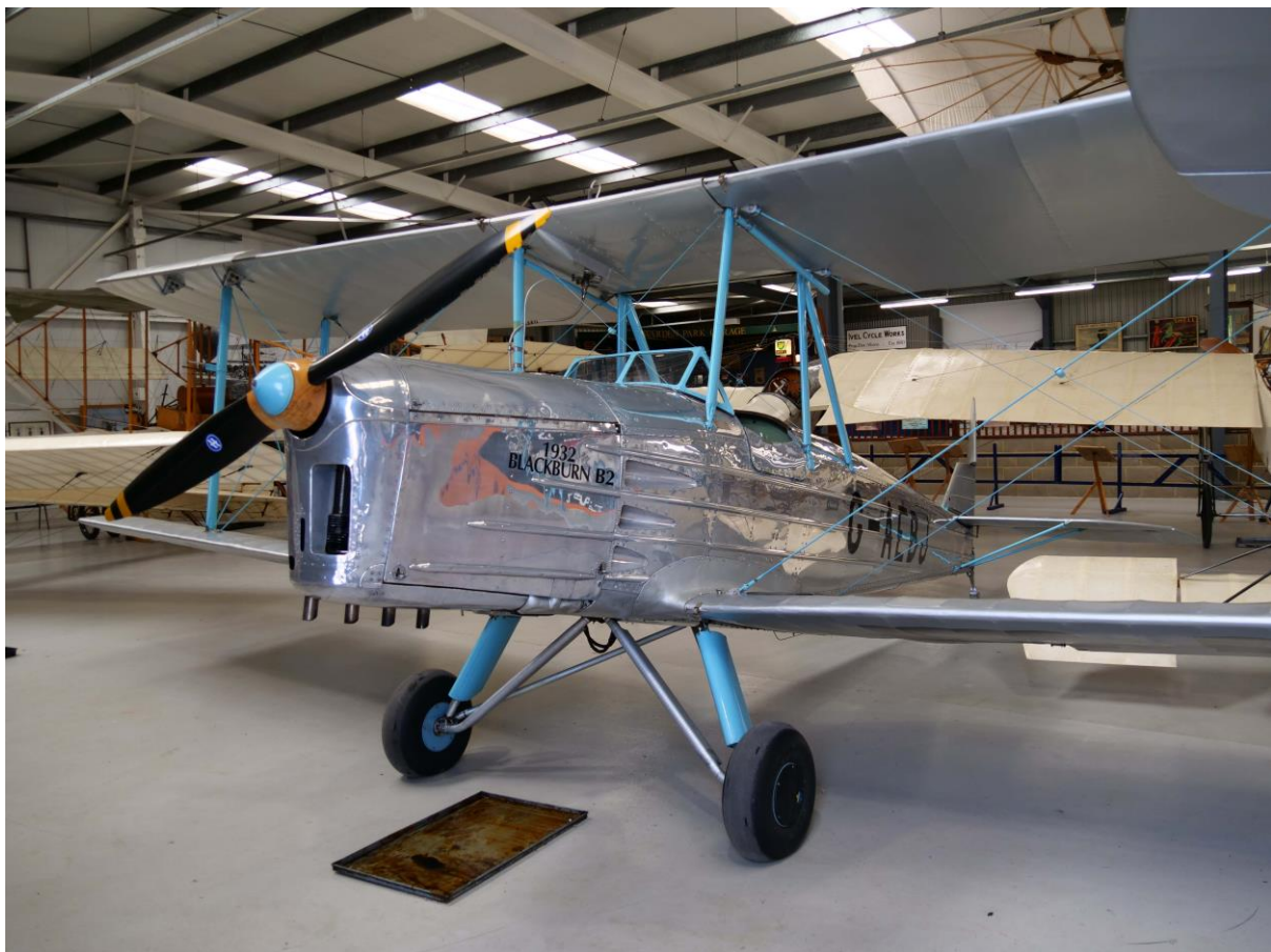
The Blackburn B2

Three of the aircraft were owned by BAE Systems, the Blackburn B2, Cirrus Moth and the Avro Anson. They were donated to the museum earlier this year along with a £75,000 donation to help with their maintenance.