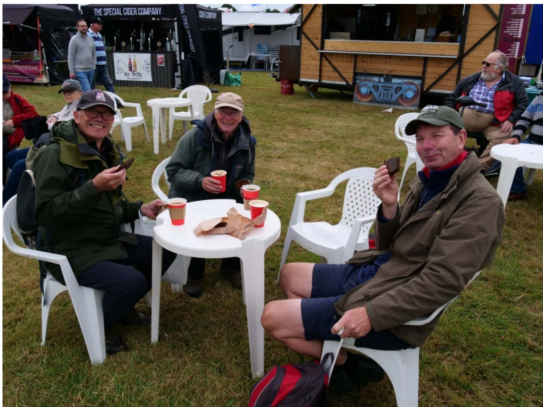
Coffee and brownie stop!